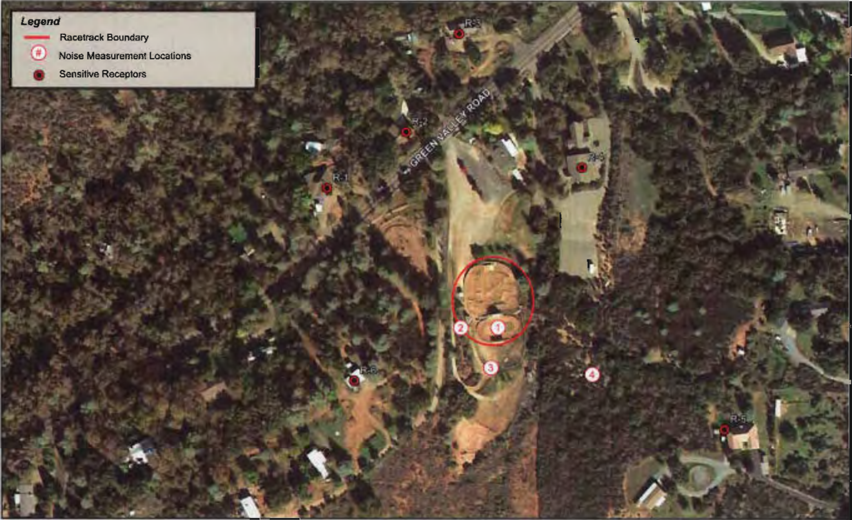
Figure 1 RCC Racetrack - Rescue, CA Project Vicinity & Noise Measurement Locations