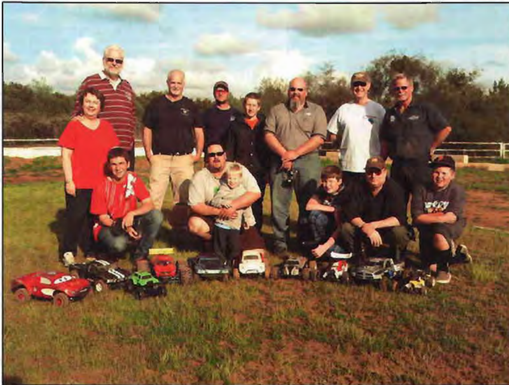
Figure 4 – Electric Cars Monitored during April 6, 2013 Noise Survey

In light of the results of the April 16, 2012 noise tests, the project applicants have decided to limit racing activities at this site to the quieter electric cars. As noted above, in the original testing only one (1) representative electric car was monitored with that data extrapolated to represent the noise generation of ten (10) cars racing at once. In response to concerns expressed by the County regarding the accuracy of the extrapolation procedure used in the May 2012 report, BAC repeated the noise testing at the site with ten (10) electric cars operating concurrently on April 6, 2013. The electric cars operated during the test, which are shown in Figure 4, consisted of both one-eighth and one-tenth scale cars.