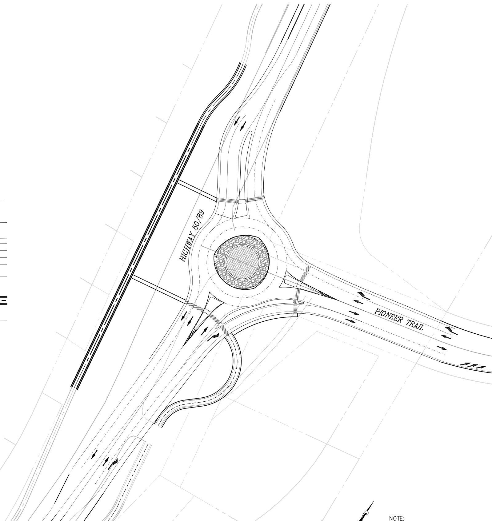
PIONEER TRAIL ROUNDABOUT OPTION

NOTE: APACHE ROUNDABOUT ONLY WORKS WITH OPTION 3 (NO FRONTAGE ROADS)