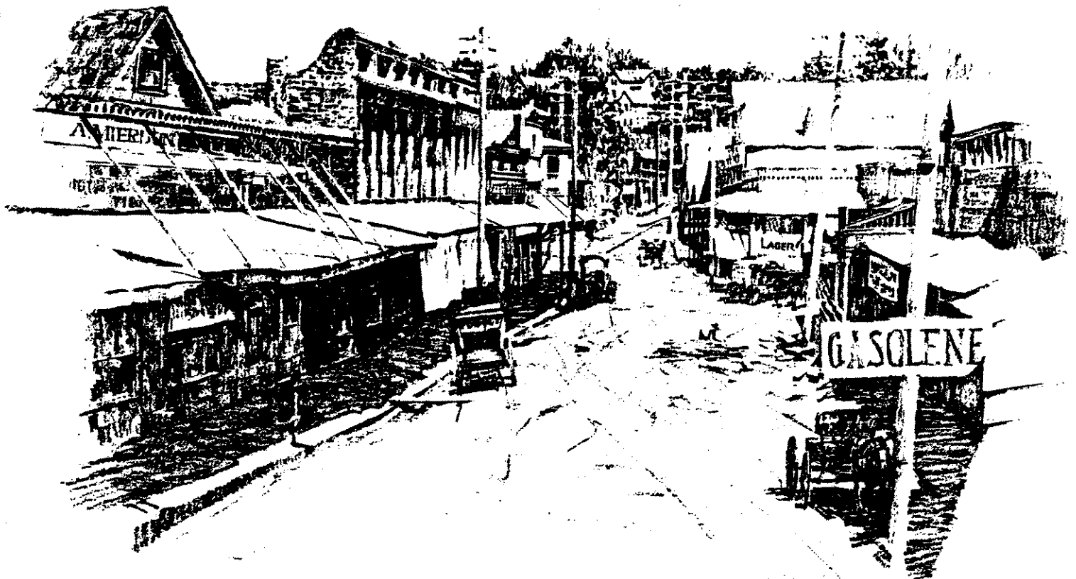
Looking East, Placerville's Main St., 1905