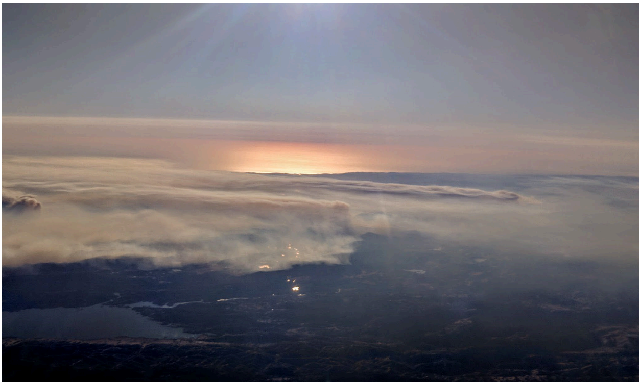
(Aerial view of the Tubbs and Pocket fires, 10/12/2017)